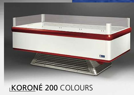
KORONÉ 200 COLOURS