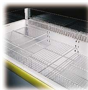
Grills and bottoms adjustable in height