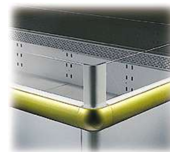
Upper in metacrylate