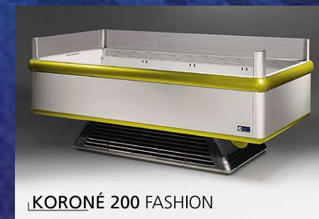
KORONÉ 200 FASHION